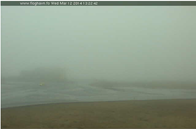
Vágur Floghavn - www.floghavn.fo

At the time I made the screenshots of these three low-visibility images, Atlantic Airways' daily Airbus A319 flight RC453 was en route from Copenhagen (CPH) to Vágur, with arrival scheduled to be at 1350. Therefore I was keen to see: would he have to turn back because of difficult conditions for landing at FAE?