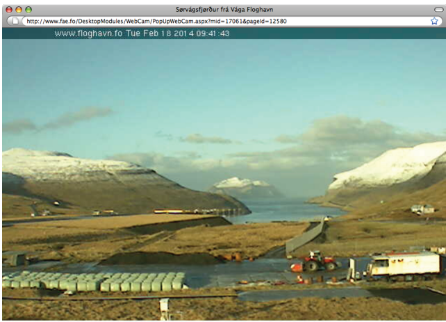
Vágur Floghavn - www.floghavn.fo