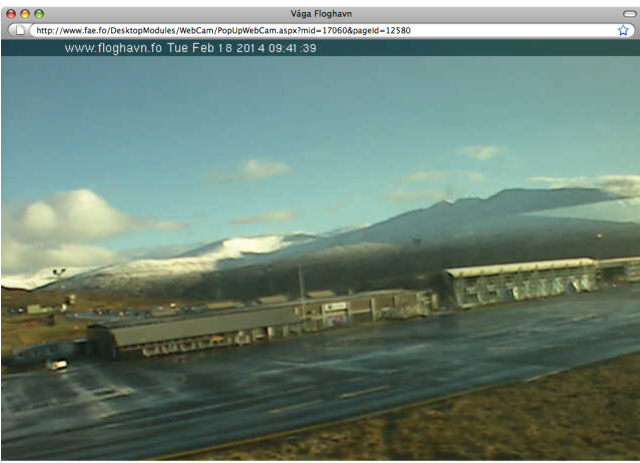
Vágur Floghavn - www.floghavn.fo

So as a comparison, here's what FAE looked like in good weather on the morning of 2014 February 18 exactly at solar eclipse time, 0941, as seen from the three airport control tower webcams: