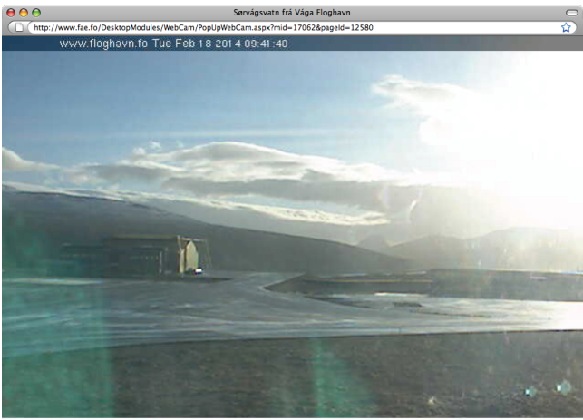
Vágur Floghavn - www.floghavn.fo

Whereas here's what it looked like on 2014 March 12 at 1319 1320 and 1322 in very-poor-visibility weather as seen from the same respective three webcams: