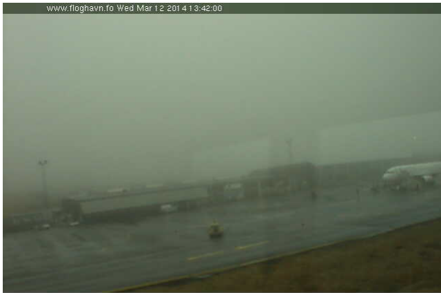
Vágur Floghavn - www.floghavn.fo

Well...he didn't have to turn back...he landed evidently normally! As seen in the two webcam images below at 1342 and 1345 showing passengers disembarking, and also the website Arrivals/Departures listing: