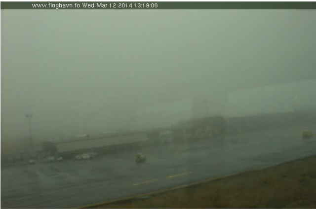
Vágur Floghavn - www.floghavn.fo

Whereas here's what it looked like on 2014 March 12 at 1319 1320 and 1322 in very-poor-visibility weather as seen from the same respective three webcams: