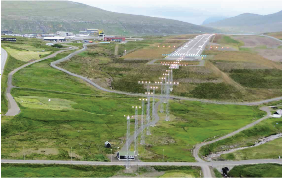
FAE VAGAR AIRPORT