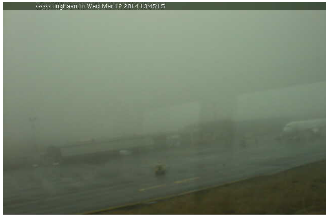
Vágur Floghavn - www.floghavn.fo