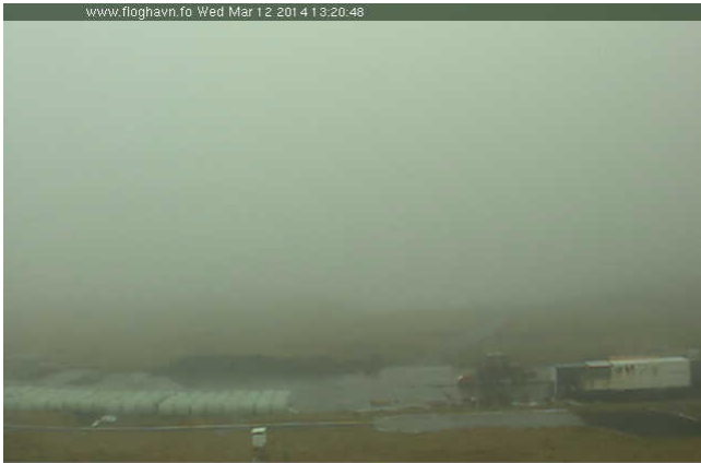
Vágur Floghavn - www.floghavn.fo