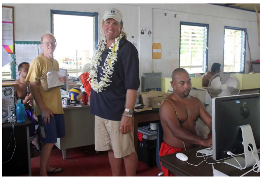
Office Friday 2013

Surprisingly, now Woleai does have a small generating station providing electricity 24/7 and, since early 2014, “slow, but usable” internet including wi-fi...also an air-conditioned dispensary and a general store and a high school where you can stop in at the main office facility → so, as a visitor to Woleai you need not feel entirely cut off from “civilization”...and don’t forget bureaucrats with clipboards, yes there will be a couple of those too, to greet us upon arrival thereby truly assuring everyone we can feel right at home! :)