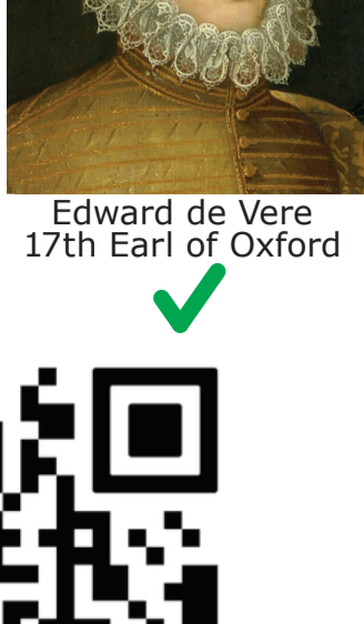
Edward de Vere 17th Earl of Oxford