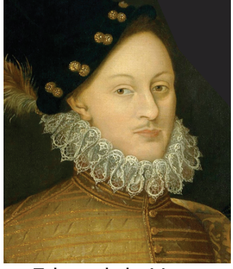
Edward de Vere 17th Earl of Oxford